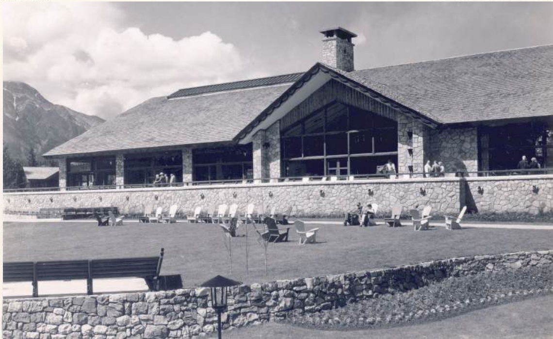
JASPER PARK LODGE