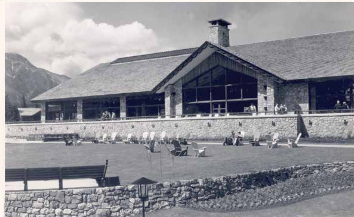
JASPER PARK LODGE